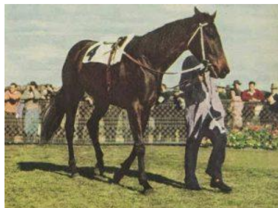
WIGGLE . . . 14 wins in Australia and seven more in the US.

In Australia, Wiggle started 24 times for 14 wins, 4 seconds and 2 thirds.