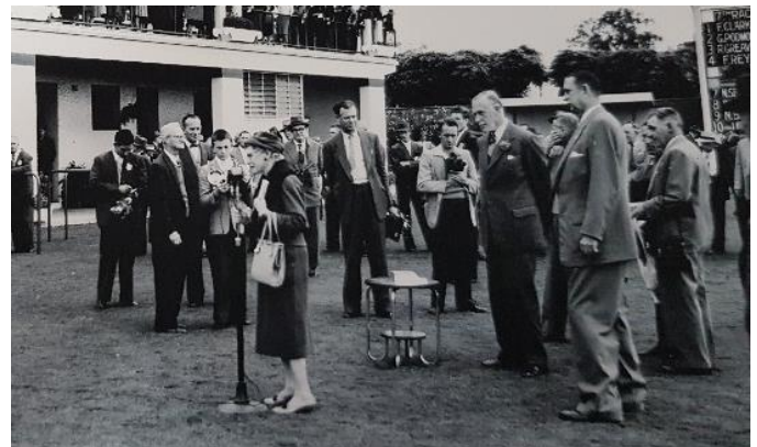
LONE LADY . . . the photograph our researchers were asked to identify.

An uncaptioned photograph of a post-race trophy presentation at Doomben became a pleasant challenge for our volunteer researchers at the Racing Archive.