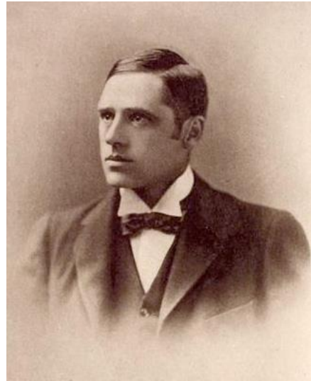
BREEZY . . . Banjo Paterson.

It contains a mix of factual reports, fictional stories, and much loved poems and classy illustrations, such as "In the Droving Days" and "Across the Black Soil Plains" by George Lambert. A piece of prose on page 95 could be seen as a prelude to the iconic "Man from Snowy River".